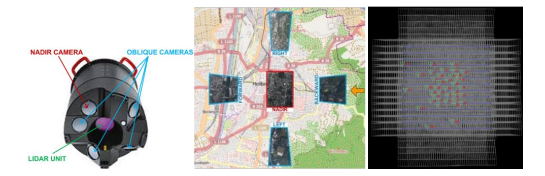
Figure 1. The Heilbronn CityMapper dataset. Left: the Leica hybrid sensor. Centre: the planned flight trajectories (blue lines), image footprints (white polygons) and control points (green triangles). Right: the image footprint of one single exposure (nadir image in red, oblique images in blue).

A more balanced distribution of tie points across camera views is achieved by applying an iterative regularization strategy, including tie points filtering based on geometric and statistical criteria, and automatic points tracking based on the initial EO parameters. Corresponding results are reported in Table 2.