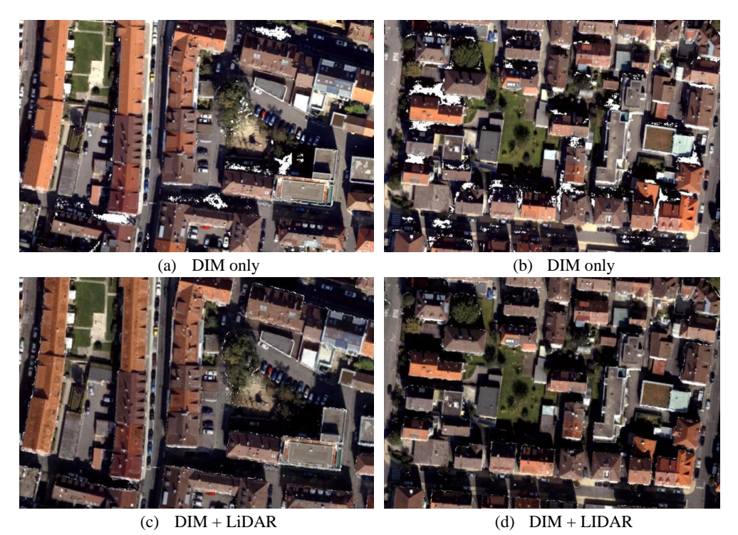
Figure 3. Dense 3D reconstruction based on imagery only (a,b) and generated by integrating DIM and LiDAR data based on their precision and density (c,d).

However, a rigorous and consistent integration of DIM and LiDAR points is quite challenging, given their high variation in spatial resolution and precision. These differences should be considered while fusing the two sources of information. For instance, within the nFrames software SURE the photogrammetric precision values for each individual point are estimated and used during the fusion process. As an example for this, Figure 3 shows two views of the DIM results achieved from imagery only (top), and integrating LiDAR data (bottom). They were generated from the Leica CityMapper dataset of Heilbronn, using the SURE software.